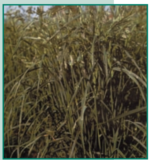
Figures 2 & 3. Orchardgrass stand and close-up of its seedhead.

Most cool season grasses that presently exist in Kentucky are European in origin.