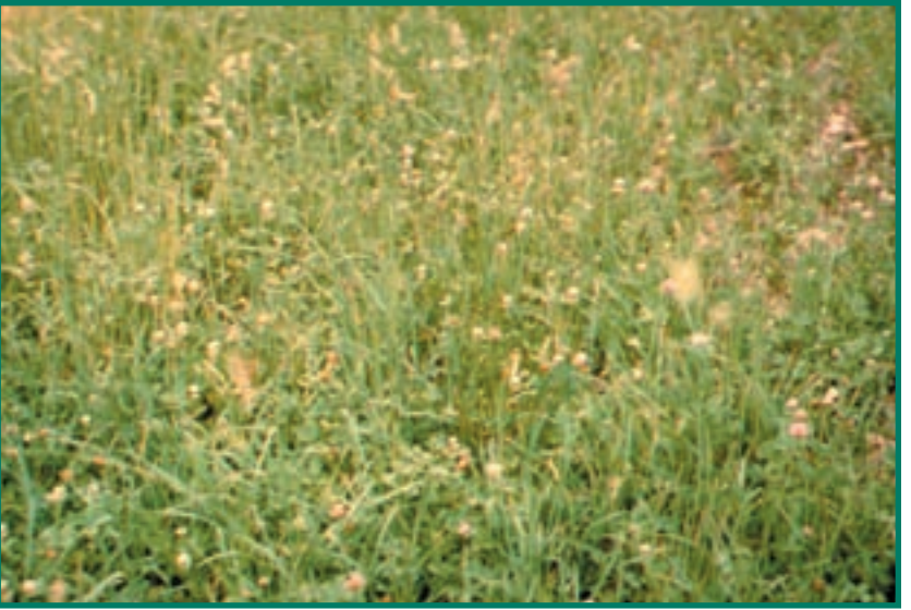
Figure 1. Mixed stand of cool season grasses and legumes.

annual lespedezas (Korean & Kobe)) provide abundant food and which in turn attract numerous insects important to young chicks as a source of protein in spring. Most cool season grasses are fairly short, growing to 3-4 feet in height. They are adapted to well-drained, fertile sites. Although they can tolerate occasional wetness, they usually cannot survive extended periods of flooding or soil saturation. They are also only moderately shade tolerant.