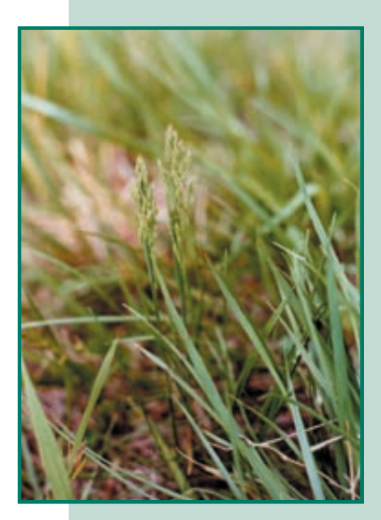
Figure 5. Redtop is an excellent soil binder along waterways.

There are 3 basic ways to plant cool season grass. It can be drilled into a herbicide-treated stand of grass, drilled into a prepared seedbed, or broadcast seeded onto a bare seedbed. Drilling into a herbicidetreated stand of grass is simplest, usually results in less weed problems due to smothering by the same residual stand of grass, and eliminates the risk of soil erosion. However, seed-to-soil contact, and subsequent germination, may not be quite as good due to the residual stand of grass. Drilling into a prepared seedbed will likely result in better seed-to-soil contact and germination. However, it requires more field preparation and could result in more weed problems due to exposure of ungerminated seeds. Also, if planting on a slope, loose soil of a tilled seedbed could erode. Broadcast seeding eliminates the need for a no-till drill, but also requires extensive field preparation. In general, no-till seeding into a sprayed field is recommended for most situations.