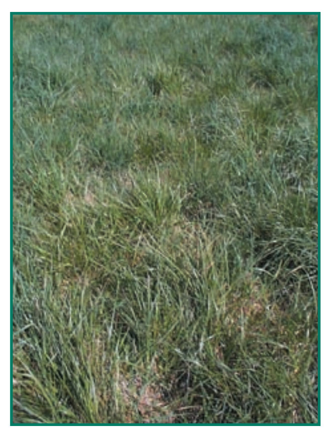
Figure 4. Mixed cool season grass stand.